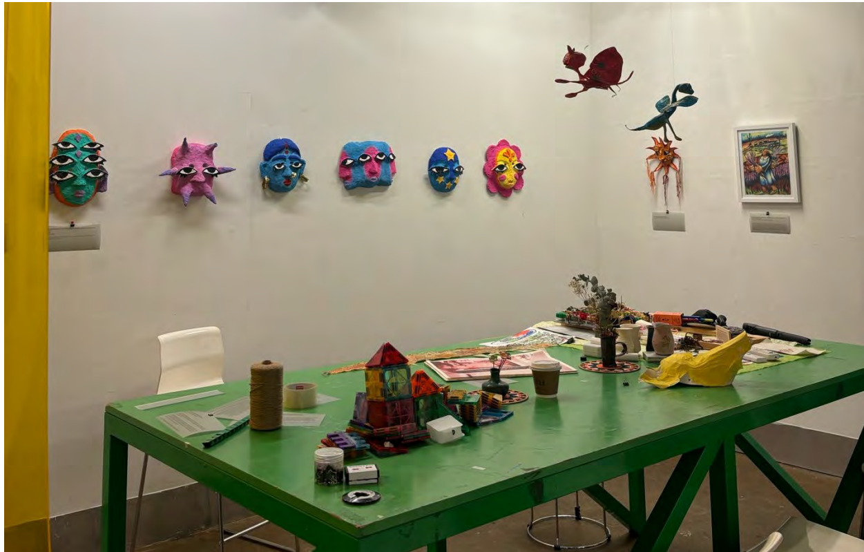
Figure 5: Installation view from Assembly: A holding space for culture at It's OK Studios during FGSA's DesignTO Festival gallery hop.

On January 31, 2026, FGSA's DesignTO Festival gallery hop brought together community members for an afternoon of conversations around design, memory, and cultural identity within the South Asian diaspora in Toronto.