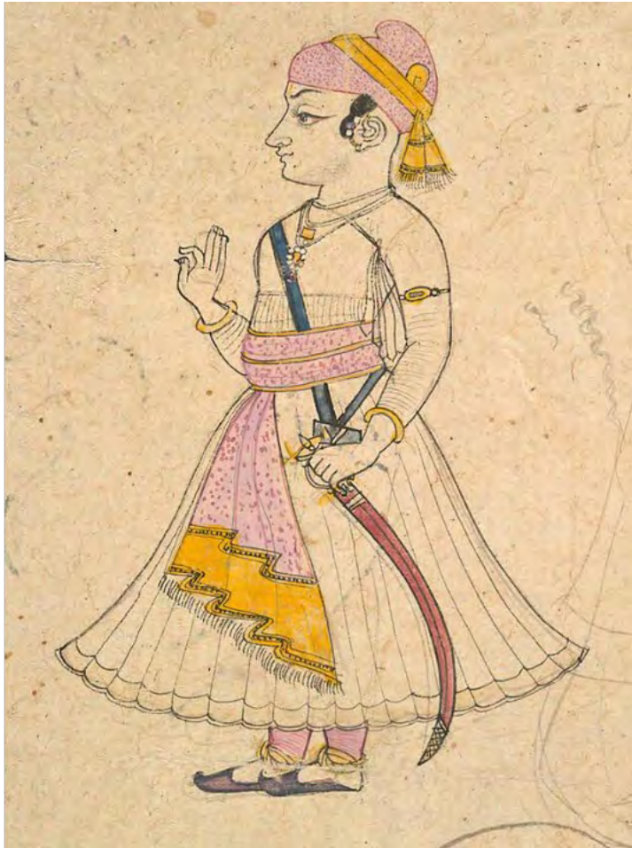
Figure 4: Sketches from an artist's notebook, ink and watercolour on paper, Jodhpur (Marwar), Rajasthan, India, 19th century, 2009.10.39.

How often do we get a glimpse of sketches from Marwar paintings?